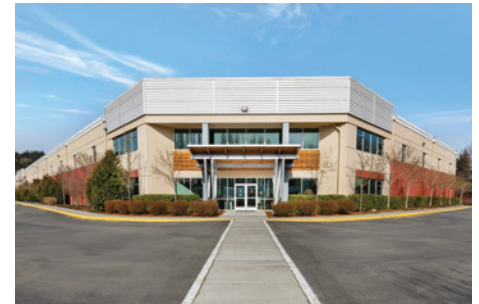
The Reserve at Woodinville SEATTLE, WA | \pm 165,000 SF