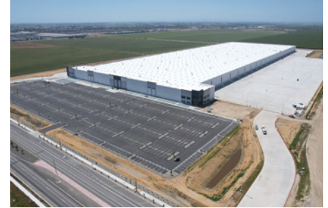
Central Point Phase III VISALIA, CA | \pm 1,270,000 SF