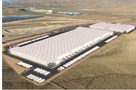
Project Highlander LAS VEGAS, NV | \pm 1,480,000 SF