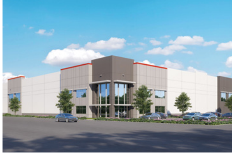
West Valley Logistics WALNUT, CA | \pm 270,000 SF