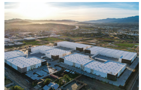
Palomino Ranch INLAND EMPIRE, CA | \pm 2,000,000 SF

PHASE I: \pm 2.6 M SF DELIVERED IN Q3 2023