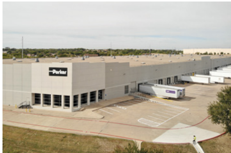
Peachtree Distribution Center DALLAS, TX | \pm 397,000 SF