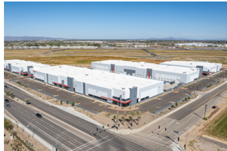
Chandler Airport Business Center CHANDLER, AZ | \pm 319,000 SF