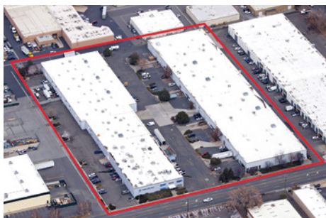
120-250 Greg Street RENO, NV | \pm 177,000 SF